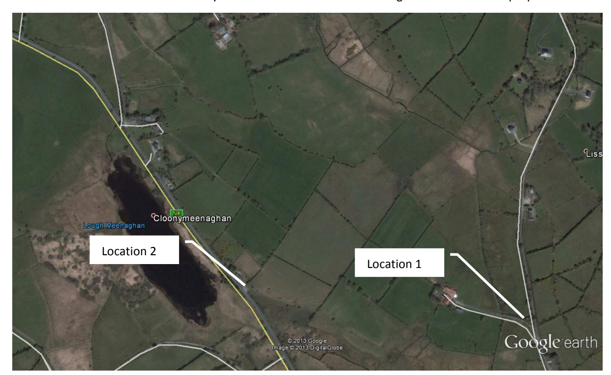
Figure 1-1: Noise survey locations

Location 2 is located in the vicinity of the nearest residential dwellings to the west of the proposed sited.